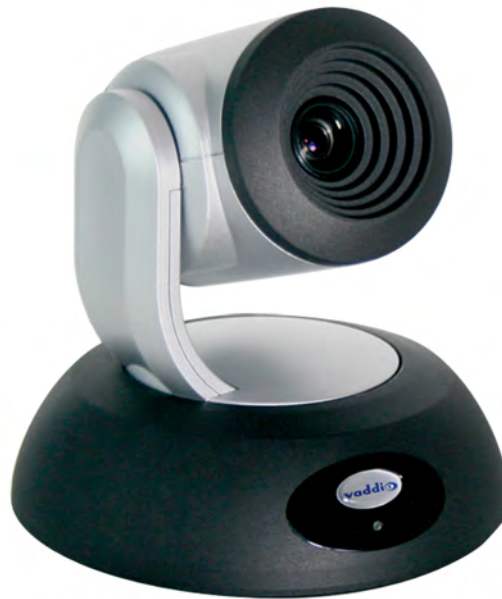
Image: RoboSHOT 12 USB, HD PTZ Camera with 12X Optical Zoom and 73° Wide Horizontal Field of View

The RoboSHOT 12 USB camera was designed for the times and represents a new era in specifying and integrating professional quality cameras into UC Conferencing and Pro AV system configurations. The features, flexibility and the value of the RoboSHOT 12 USB conferencing camera is unparalleled in today's PTZ camera market. All this and it's made in the USA, at the Vaddio HQ in Minnetonka, Minnesota.