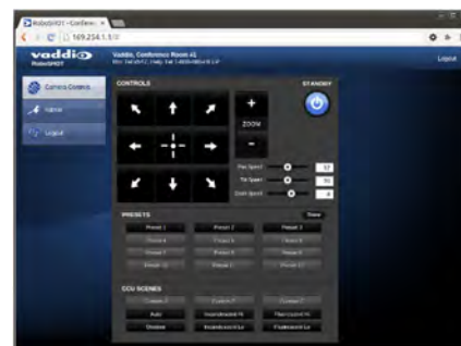
Example: Built-in Camera Control Web Page