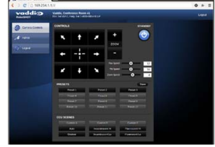
Example: Built-in Camera Control Web Page

The RoboSHOT 30 was designed for the times and represents a new era in specifying and integrating professional quality cameras into large room system integrations. In short, it has never been easier to integrate cameras into any large to medium room system than with the RoboSHOT 30.