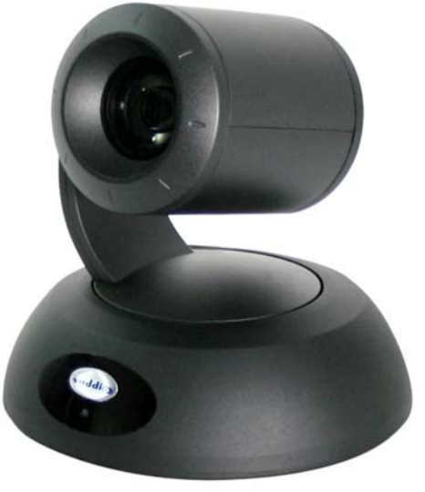
Image: RoboSHOT 30 HD PTZ Camera (Black and white models available)

The key features of the RoboSHOT cameras are Tri-Synchronous Motion, the silent direct drive pan/tilt motors, advanced Exmor® image sensor, multi-element lens and ISP (image signal processor) combination.